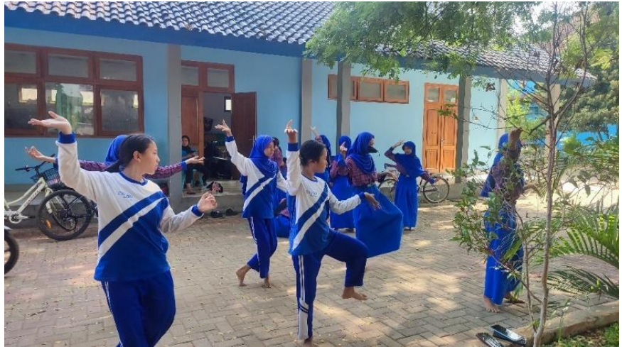
Figure 2: Student of SMP Negeri 2 Rembang Learn SLD through SLD Learning Media