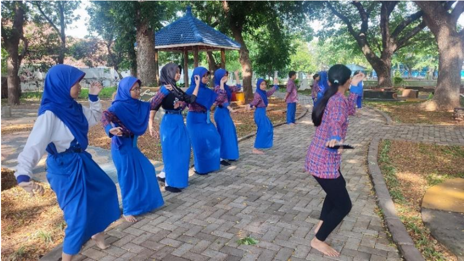
Figure 3: Students by Working Together Learn the SLD Using Peer Tutoring Method

carried out in groups using peer tutors or imitating the movements performed by the props.