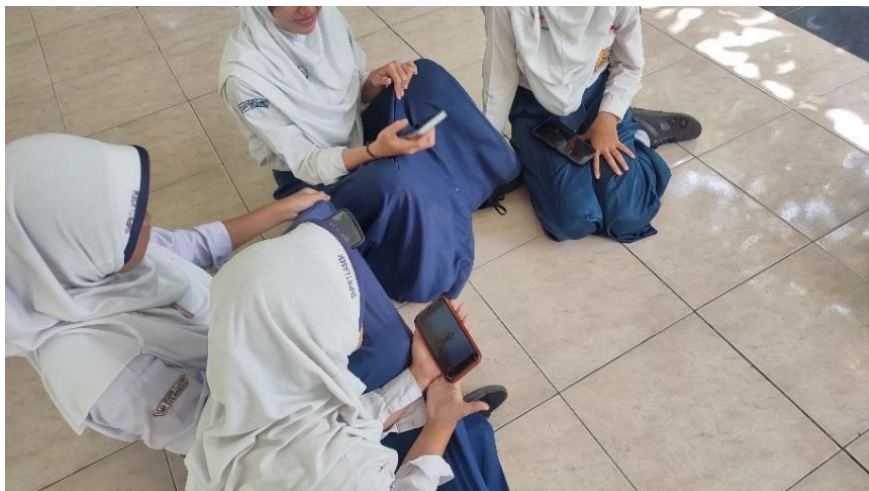
Figure 4: Students Learn Using SLD Learning Media Independently

Figure 4 shows four students watching the SLD learning media on their cell phones. Students can learn the SLD independently in their free time, and then they practice the results of independent learning with the teacher as proof of student mastery. Educators only explain a few parts if students do not understand the explanation in the SLD learning media. Students actively and responsibly learn the SLD, which shows an independent dimension.